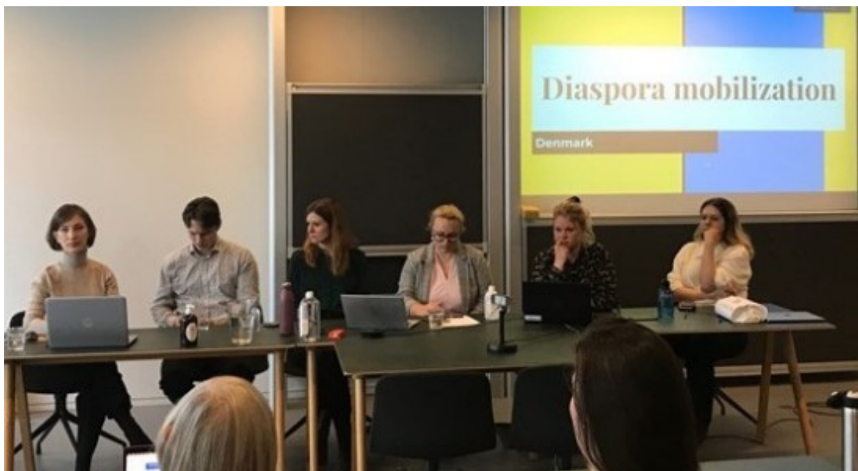
Photo: the diasporic mobilization of Ukrainians in Denmark: Ukrainian voices