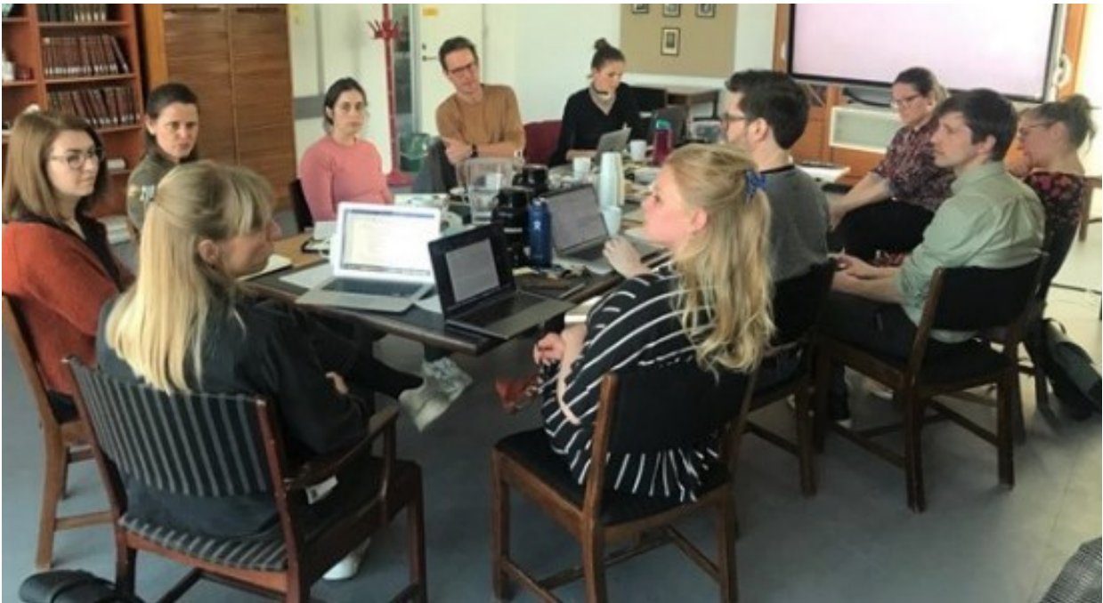
Photo: AMIS Publication Workshop in March 2022